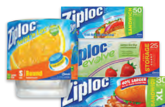
storage bags & containers